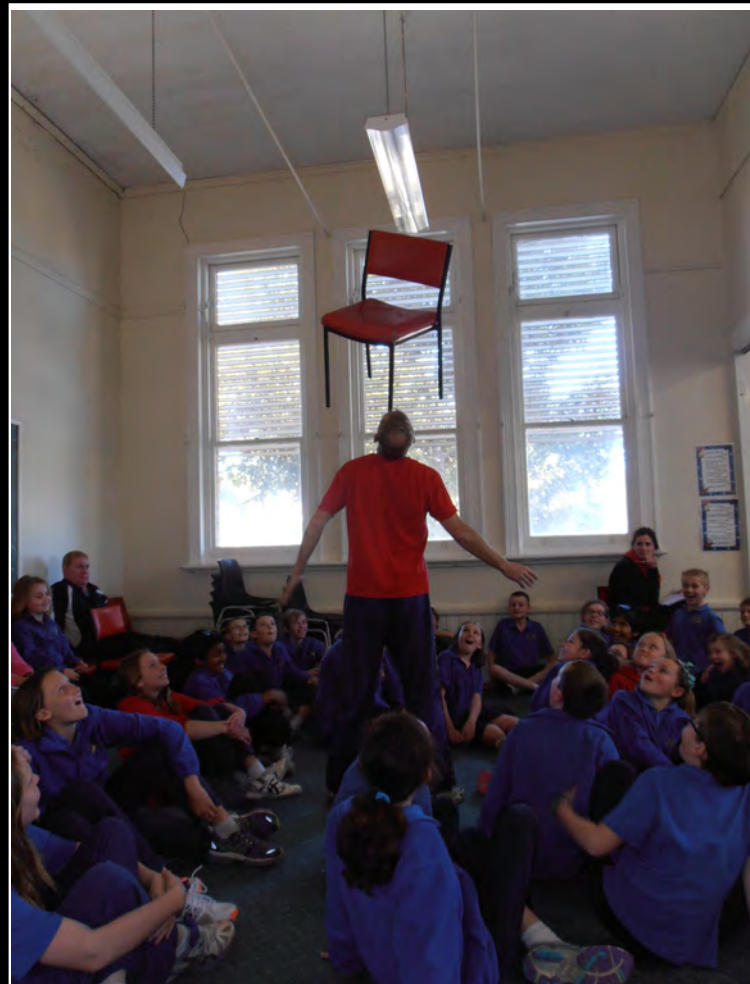
One of the many tricks performed during the 'It's a Mad World' performance last week.